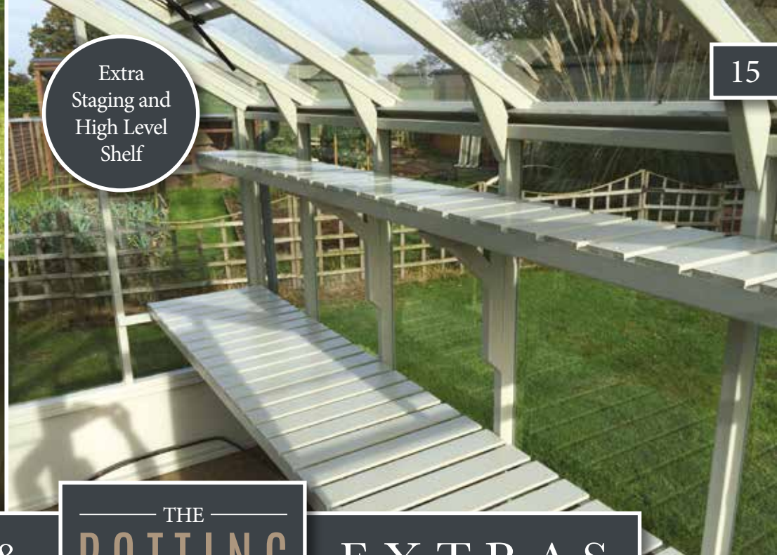
Extra Staging and High Level Shelf