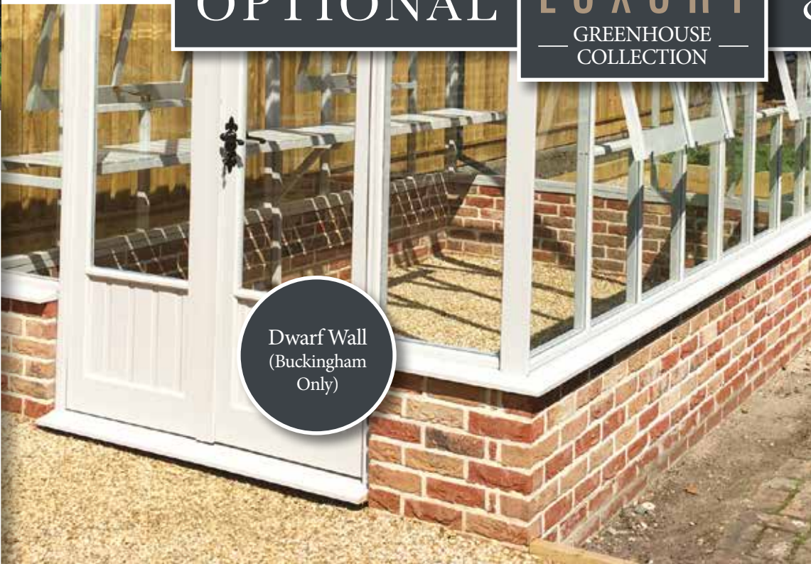
Dwarf Wall (Buckingham Only)