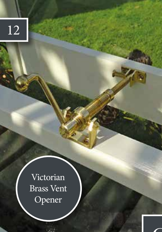
Victorian Brass Vent Opener