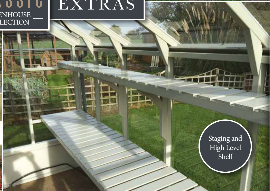
Staging and High Level Shelf