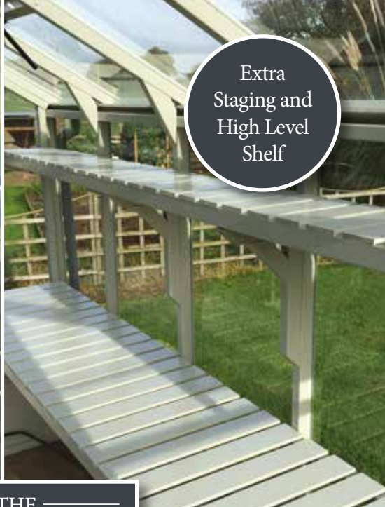
Extra Staging and High Level Shelf