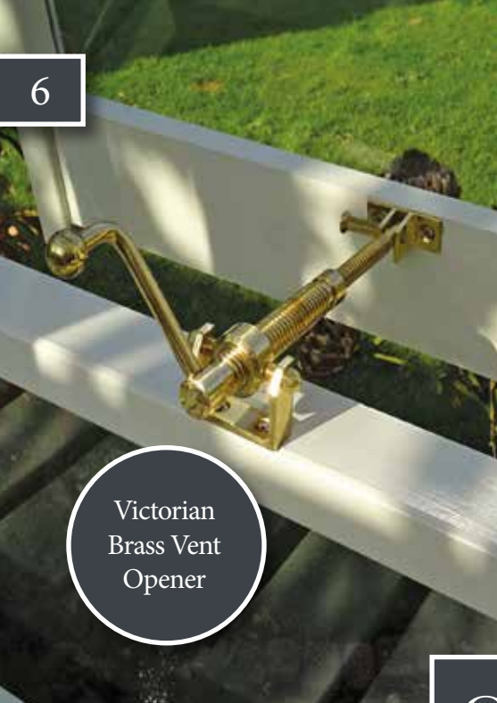
Victorian Brass Vent Opener